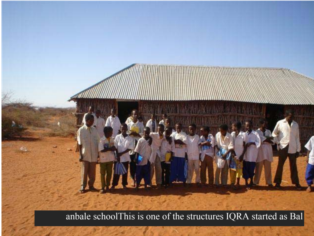
anbale school This is one of the structures IQRA started as Bal